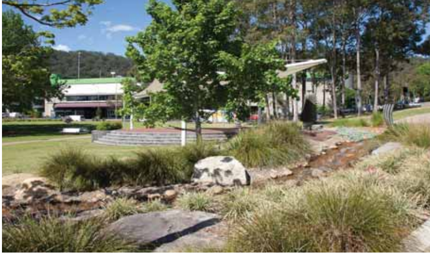
Kibble Park Gosford